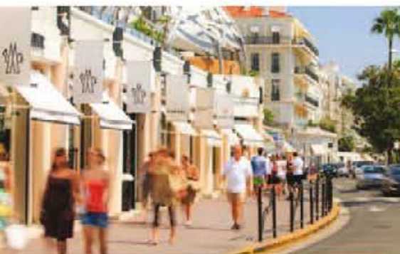
Boulevard La Croisette

See CROISSETTE GUIDED TOURS section, page 20.