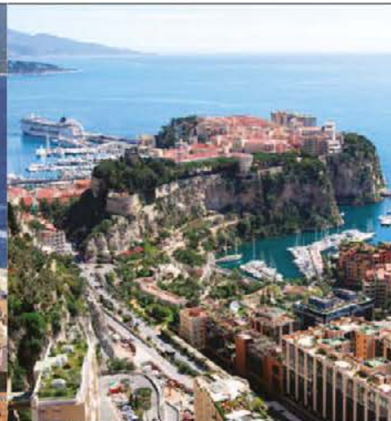
PRINCIPALITY OF MONACO