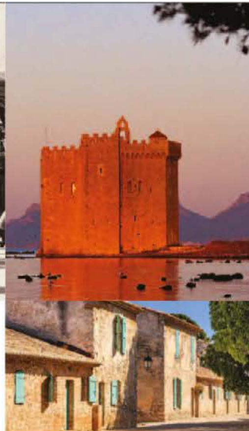
Top: The fortress on Saint-Honorat island; Bottom: Sainte-Marguerite island

This is how the first Autumn-Winter tourist season was born. With paid holidays, this changed to a Spring-Summer touristic season.