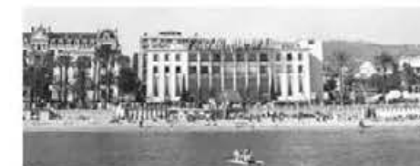
La Croisette, the former Palais des Festivals.

Golf developed around 1890, under the impulse of Grand Duke Michael of Russia, the founder of Cannes Golf Club in Cannes-Mandelieu... Yachting, which arrived a few years earlier under the aegis of the Duke of Vallombrosa, finally achieved recognition here when the Prince of Wales, the future King Edward VII of Great Britain, established the prestigious Royal Regattas that brought the crowned heads of England, Russia, Denmark and Sweden together in the Bay of Cannes. The 20 th century transformed the city of Princes into the leading tourism destination on the Côte d'Azur.